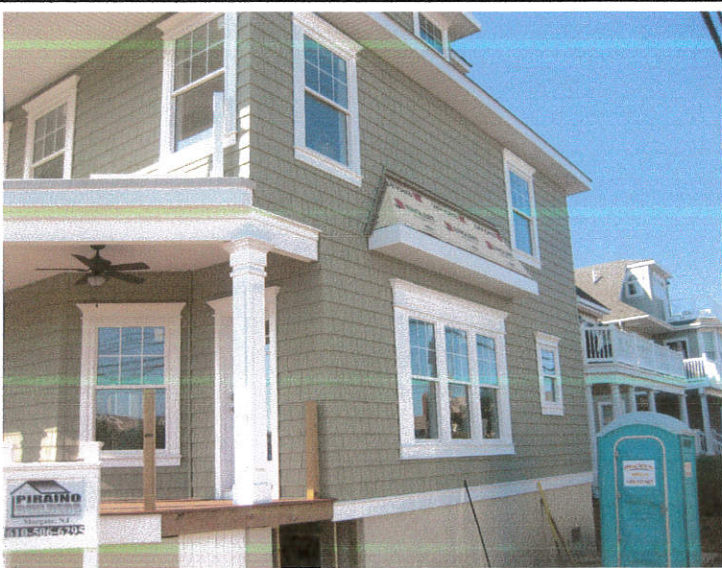
Rear View – Date of Photograph: (06-20-13)